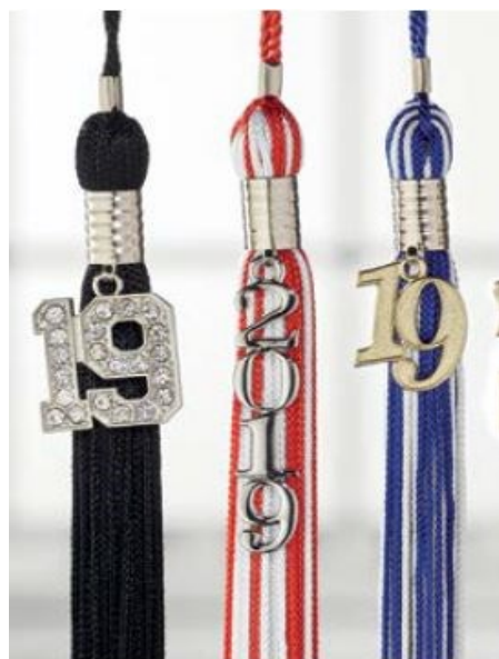
Status Stacked Classic