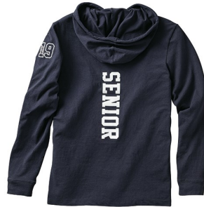
LONG SLEEVE HOODED TEE